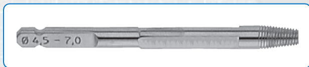
Conical extraction tips (mm) \varnothing 1,5 à \varnothing 2,0 - \varnothing 2,7 à \varnothing 4,0 - \varnothing 4,5 à \varnothing 7,0

A simple and compact solution for extraction of broken or damaged screws from \varnothing 1.5\text{mm} to \varnothing 7.0\text{mm}