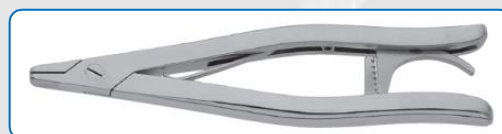
Screw holding forceps - Length 205mm